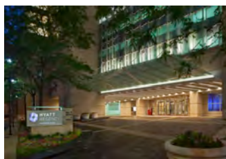
Hyatt Regency McCormick Place